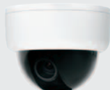
Discover Mini Domes